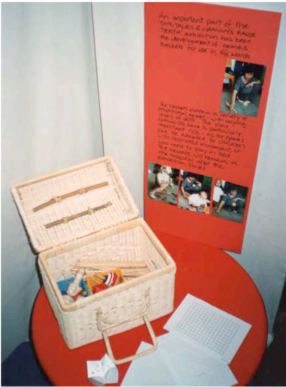
Figure 4. One of the 'play baskets' of games. (Photo credit: McKinty, 1990)