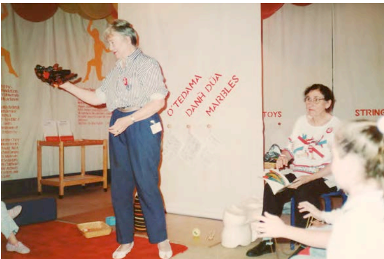
Figure 5. Storytelling with puppets.