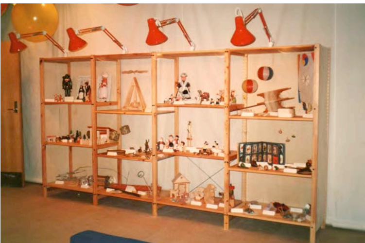
Figure 3. The display of traditional playthings.