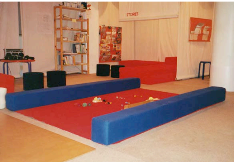
Figure 2. An area of the exhibition space.