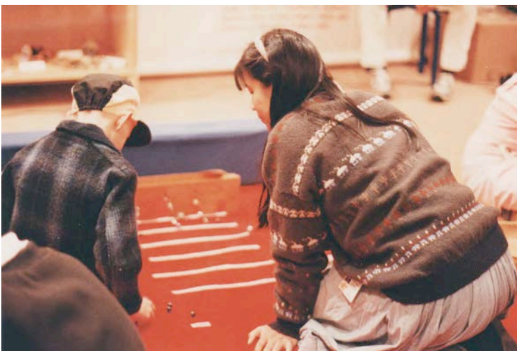
Figure 6. Playing Marbles on the mat.