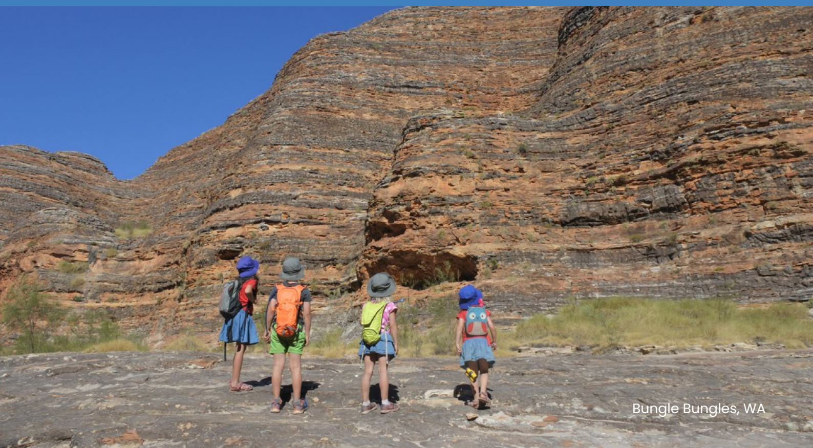
Bungle Bungles, WA

We pay our respects to the people, the cultures and the Elders past and present.